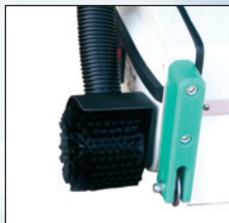
Brush for Edges Runners