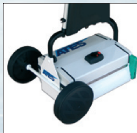
Trolley for Transport