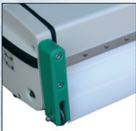
Adjustable / Universal runners

W44 escalator results extremely interesting and convenient, as with an easy operation in some minutes it's converted in a valid floor/carpet scrubber of medium dimension.